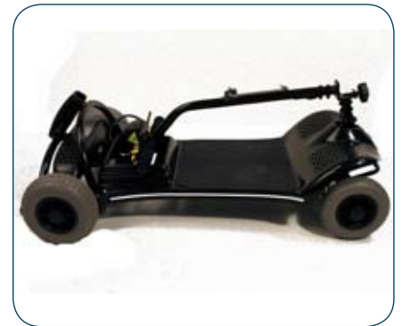
Folds easily for transportation or storage