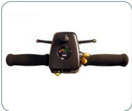
Simple controls. Small, easy to use controller with the added security of an off/on key switch

Looking for the ideal portable scooter which combines simplicity of use and style? Try the bright Little Star from Sterling.