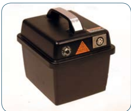
Lightweight battery pack 7.3kg (16lbs)