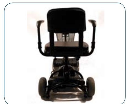
Narrow profile with a compact width of 50cm (20") navigating through doorways causes no problem