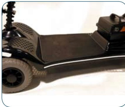
Footmat for comfort